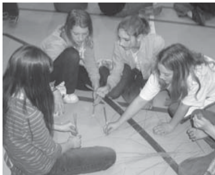
Junior Highers work together to make towers of spaghetti and tape.

into one incredible weekend of worship, fun, fellowship, and Christ-centered challenges.